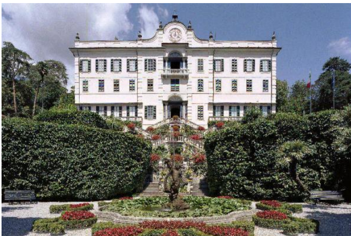
Villa Carlotta (Tremezzo)