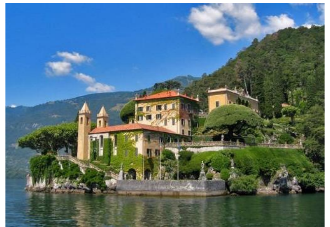
Villa del Balbianello (Lenno)